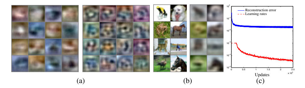
Fig. 4. (a): Two figures visualize 16 filters each with the largest norms (left) and the least norms (right) of the GBRBM trained on the whole images of CIFAR-10. (b): Two figures visualize original images (left) and their reconstructions (right). (c): The evolution of the reconstruction error and the learning rate.