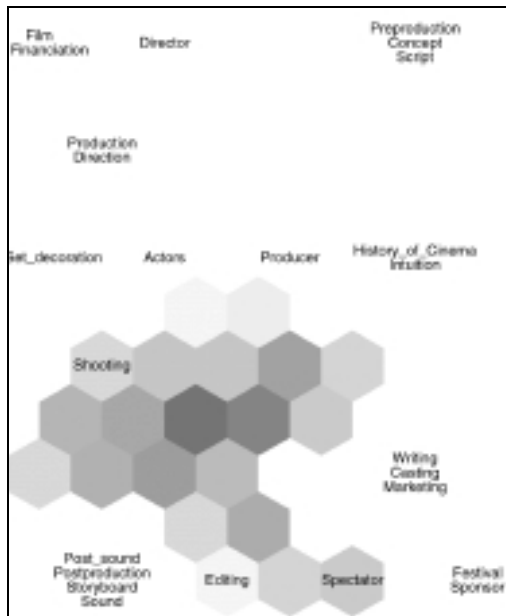
Figure 1. A map of cinematographic concepts based on input by a first year student.

A map based on first year film student's answers was also created (see Figure. 1). First, he was asked to draw a mind-map about the concept "film". Second, those 25 concepts were collected from the mind map. The student was asked to provide values according the method explained earlier in this article. The result gives a picture how the student has conceptualized the filmmaking process in his studies. A related web-based environment on filmmaking is accessible at the site http://www.mlab.uiah.fi/elokuvantaju/