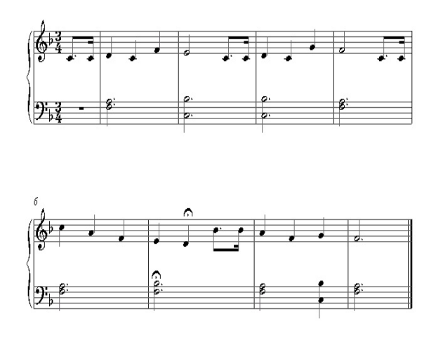
Figure 1: A music sheet of the music score for the song happy birthday to you taken from http://www.8notes.com.

ing algorithms based on dynamic programming (DP) [4]. In particular, dynamic time warping (DTW) [16] is widely used for time series data. Constrained Dynamic Time Warping (cDTW) is a modification of DTW that places constraints on the possible alignment between two sequences [32]. These DP-based algorithms can be used both for full sequence and for subsequence matching, and identify the globally optimal subsequence match for a given query [23, 25, 33]. While this complexity is definitely attractive compared to exhaustively matching the query with every possible database subsequence, in practice subsequence matching is still a computationally expensive operation in many real-world applications, especially in the presence of large database sizes.